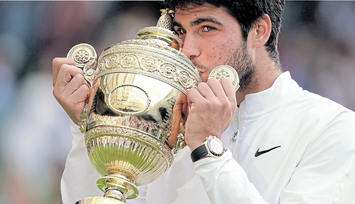
Carlos Alcaraz of Spain with the men's singles trophy following his victory against Serbian Novak Djokovic in the Wimbledon final on Sunday.